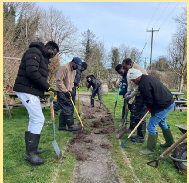
People seeking asylum help with maintenance work in the Link Park

In February, the community turned out in force to support our BBQ with people seeking asylum based near Dumfries. The event was a partnership between ACT and Plant Listening, meat was provided and community members brought along extra dishes to share. It was a heartening show of solidarity and friendship that has never felt more important. More positive still was the support we received on our Facebook post after the event, which recieved more engagement and 'likes' that any previous posts. Thank-you to all who took part, we hope to run more events like this in the future.