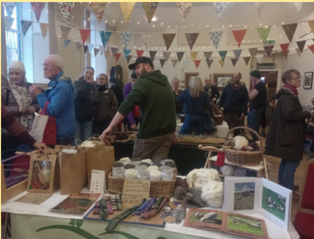
The Christmas market was very popular, the hall was filled with local makers and was well attended by the community.

This is the second year ACT has organised a Christmas Market. The idea was to support local makers in selling their wares and support more sustainable and eco-conscious gifting through a truly local economy. It was also a very lively social event for the festive season with mulled juice and mince pies.