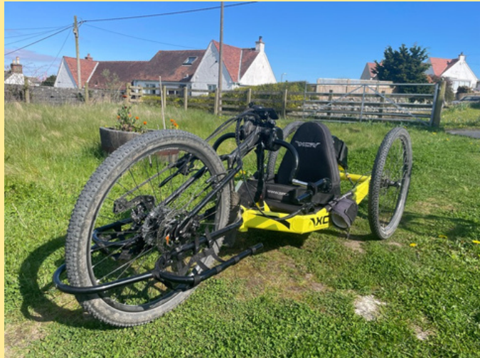
Our XCR handcycle

Adaptive bikes make cycling accessible to everyone, regardless of physical ability. ACT's specialist design XCR handcycle provides the stability and tailored control that standard bicycles lack, fostering independence and freedom while boosting confidence and mental well-being through the simple joy of movement. Adaptive bikes serve as a vital tool for social inclusion, breaking down barriers to mobility and allowing riders to enjoy outdoor activities alongside friends and family.