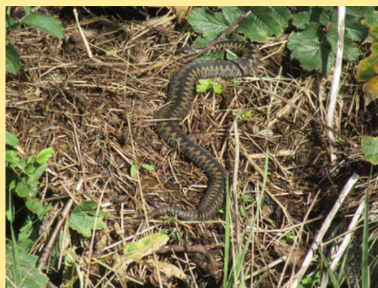
An adder enjoying the spring sunshine, spotted whilst litter picking.

The first few months of 2026 have seen us plant Rowan trees along the burn side, distribute free trees from our small tree nursery and have a litter pick in Auchencairn Bay as part of Keep Scotland Beautiful's Spring Clean Scotland. Litter picking equipment was purchased with money from our volunteer development fund.