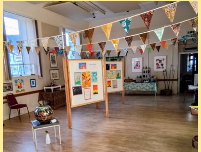
Exhibits on display in the Murray Hall, Auchencairn

A "Cabaret night" was held on April 19 th for the non-visual arts, with bold contributions from a huge array of mostly musical talent. This proved to be a very popular event, which it is hoped to repeat some time in the winter of 2026.