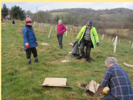
Maintaining trees and fruit bushes in the community field.

We have a monthly gathering which in the winter months tend to focus on tidying our small tree nursery, collecting tree tubes from local woodland for re use and maintenance of trees and fruit bushes in the Community Field.