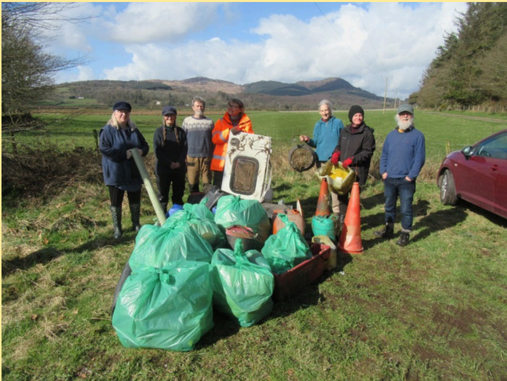
ACT Volunteers with the rubbish collected from Red Haven beach on a recent litter pick as part of the 'Keep Scotland Beautiful Spring Clean'.